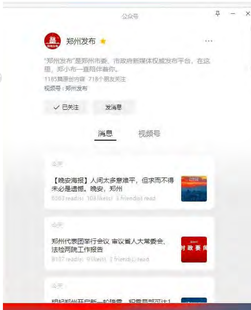
Screenshot of the Chinese Version of Zhengzhou Release's Government WeChat Account