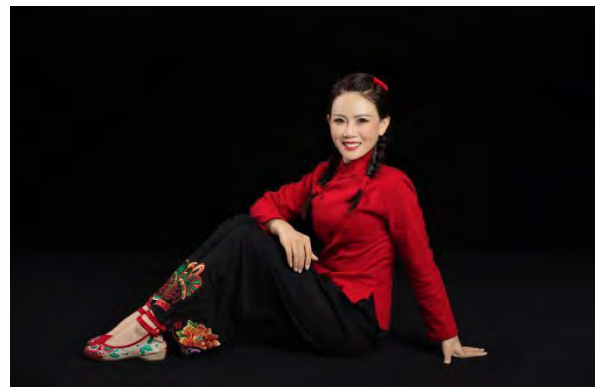
Picture 1.1 Common Performance Costumes for Male and Female