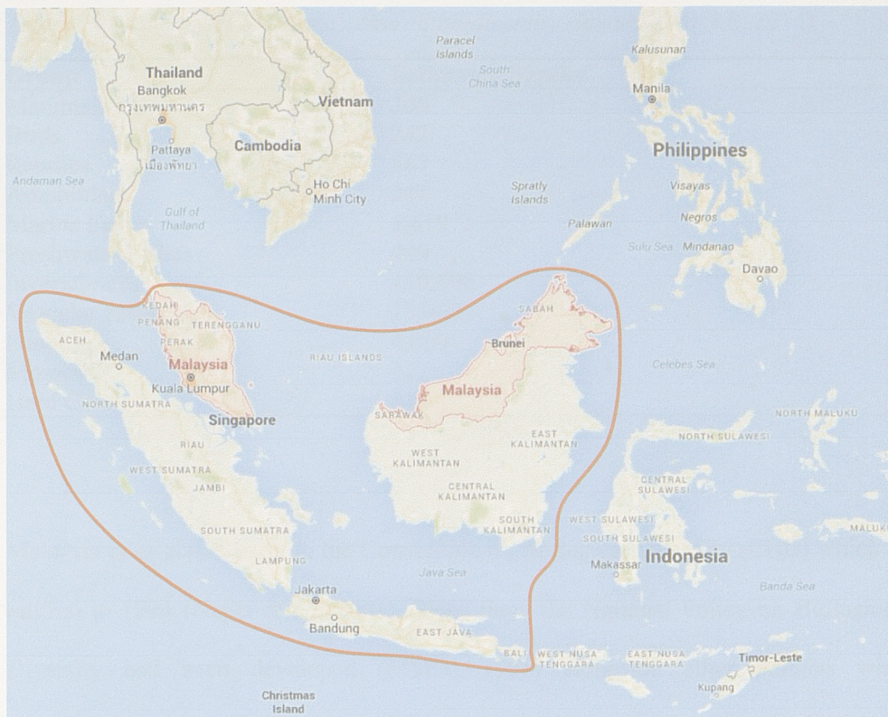
Figure 1.1 Map showing the location of Malaysia and surrounding countries. The orange line marks the Sundaland shelf today.