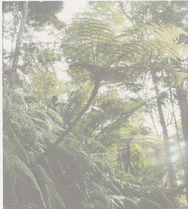
Figure 1.2 Cyathea sp. in Bukit Larut, Perak.