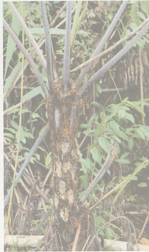
A. Cyathea latebrosa collected in Genting Highlands, Pahang.