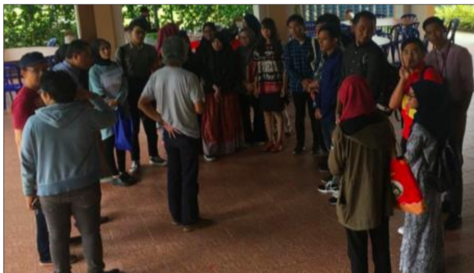
Figure 2: Initial Information Session from the Dean of the FSRD-ISBI