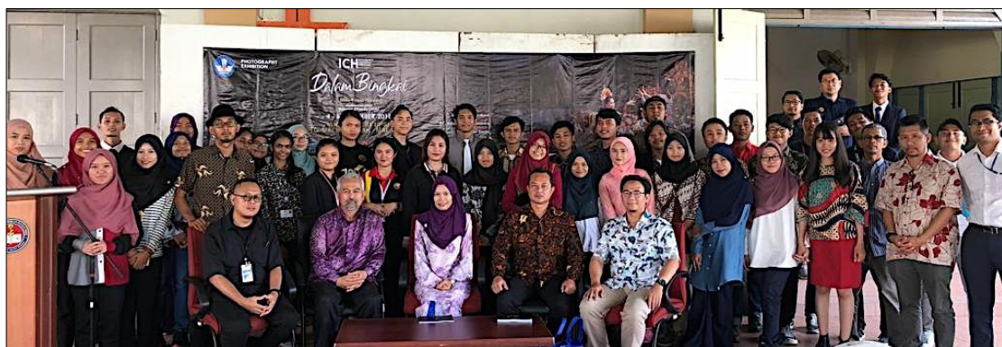
Figure 3: Memories Photo Session in Opening ceremony of JSRB-FSRD 'Dalam Bingkai' Exhibition with ISBI Delegation and Officiating Invitations

Researchers see that artists have high potential throughout the process of involvement in art and culture. However, in some cases, researchers are well aware of the condition several artists are still in the preliminary phase. The exhibition should be further strengthened with special guidance and non-verbal sharing from curators to manage and evaluate the findings of their work. There is most satisfying that secretarial establishments are working hard to find the most effective way of communicating knowledge. The arts and culture sharing program involves selected individuals who are trained as an artist. The artist develops their capabilities and brings the institution of study which always provides endless support. In particular, this article captures the field exhibition of the art and cultural sharing program as a document to share a concern audience. To achieve the optimum level, the entire organization of the joint program strives to meet the more scholarly art forms. Shared a memorable session during the opening ceremony of the JSRB-FSRD 'Dalam Bingkai' exhibition with the ISBI delegation and the Invitational Exhibit in Figure 3. Hopefully, this show will reference specific knowledge from the needs of all organizations in raising awareness of the arts and culture sharing program.