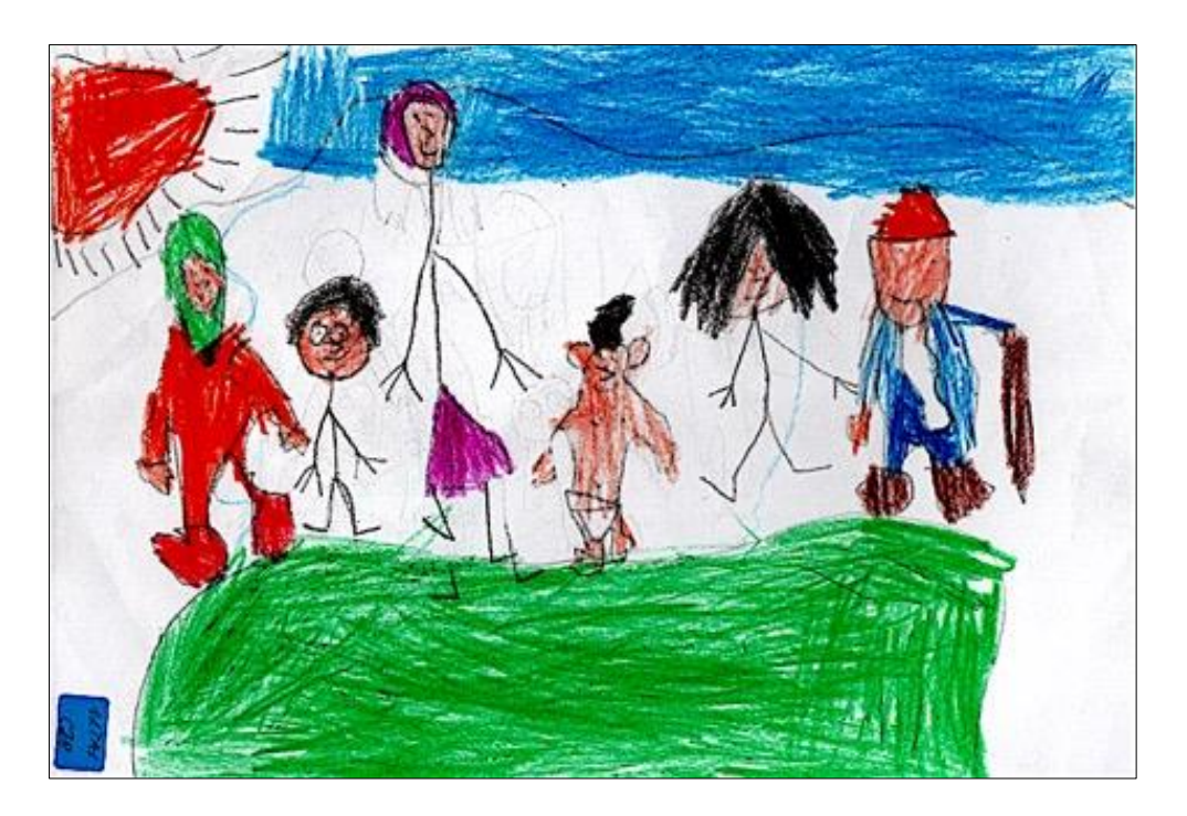
Figure 6. Addition Value to Sketch Image

Planning and practising the theme assignments for preschool children is through; (i) dimensions of senses while learning and play; (ii) the purpose of image manipulation and aesthetic understanding; and (iii) cooperation of preschool children's personality in the arts. Ob. 4506832 Pustaka upsi edu.my