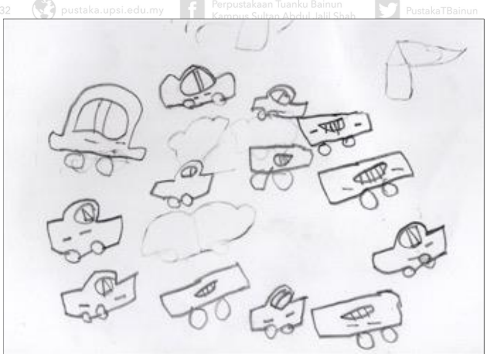
Figure 2. Image of the Vehicle

Moreover, to structure the data collection and management, researchers use the supported approach while handling a sketch program. In the beginning, the phase of sharing activities on the elements and principles of visual arts education as well as fundamental sketch techniques are explained to the teachers in advance. This participating should be stated as a preliminary explanation so as not to concern the activity procedure. Towards the approach, the time taken to explain to teachers is one hour of technical planning and explanation. Lampert (2006) proposes an approach to inquiry-based teaching techniques that will enhance critical thinking. Furthermore, the proposes towards aesthetically and creatively are inclusive approach from the art class can stimulate students' higher thinking. A focus on visual arts activities in the classroom is a plan from activity to develop professional expertise for teachers. Figure 2 shows a sketch of a children's image assignment during the class session. According to Ramli and Musa (2020), the formation session for teachers or instructors is should be conducted before any kind of teaching action exploration activities being conducted. Vecchi (2010) has stated "researchers should apprehend the approach by the ability while to recognize aesthetics that can be explained through the understanding of values, the creation of ideas, the discovery of emotions and the control of emotions" (p. xxi).