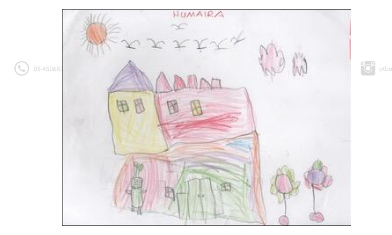
Figure 3. Image of a Dream House

According to Koster (2012), exposure and supervision of creative arts subjects can encourage children to explore and develop positive emotions in the situation of self-reflection. From the procedures used, researchers can identify the abilities and weaknesses of preschool children applying sketching and outline techniques through assignments delivered by teachers. The design of the research on the program that is being conducted opens up condition for preschooler-centred education. Zakaria et al. (2020) have stated that the design method is the phase of concentration towards data processing based on a systematic network