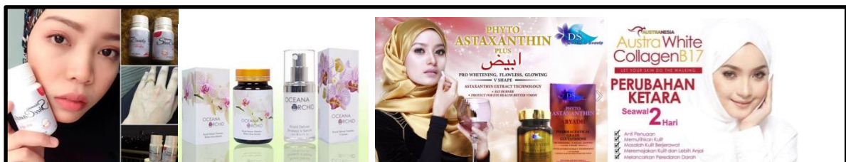
Figure 1: List of skin whitening brands as case study

A total of four brands were surveyed and inspected in this study selected based on a selected period (advertisement were seen between January to April on Facebook and Instagram) and these products were merely depending on online advertisements as their marketing strategy. These products were shown in Figure1.0 above. The advertisement later was screen-captured/saved to compare their context in term of content, visual and their approach (message strategy). This study is using both manifest and latent content analysis to create inferences objectively on the characteristics of the advertising. Conceptual framework of the questionnaire is explained as below;