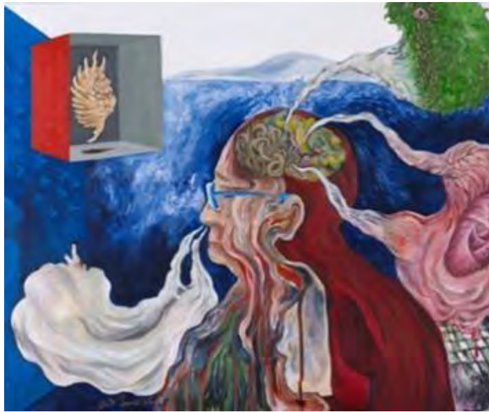
Figure 1.9.1. Anna Chin Chui Han, ‘Toleration 1’, 2011. Artist Collection

‘Toleration 1’, 2011 (Figure 1.9.3) symbolises the complexity of the human mind and the will in fighting to find balance and sustainability in life; I painted groups of natural shapes and forms such as the shell, human figure organism to symbolically represent human’s desire to live, struggles in health mechanism and facing the uncertainty from the cause of nature. The curvy and organic-like image implies air to breathe, the organs to depend on to survive, and a shell in a cube shows that a protected life may be in control and in order, yet the soul within often lacks freedom.