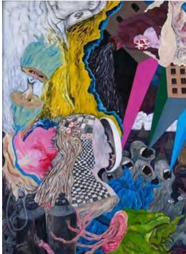
Figure 1.9.4. Anna Chin Chui Han, 'Underneath Faces and Voices', 2012. ArtistCollection

in the painting are symbolised by the image of the tropical fruit 'Buddha's Hand's twisted form and open mouth figures.