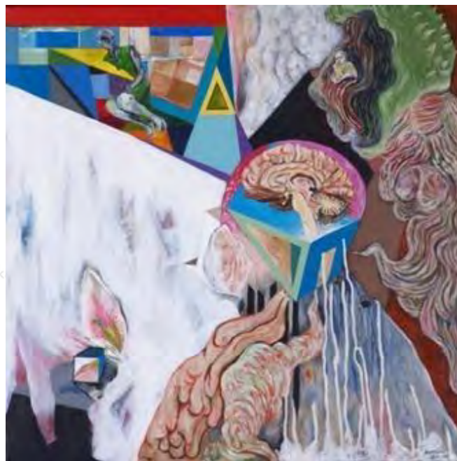
Figure 1.9.2. Anna Chin Chui Han, ‘Toleration 3’, 2011. Artist Collection

The rationale here is to express the condition of being in conflict yet determined to go against the odds and to survive, mentally and emotionally; in which symbolised by the chaos and harmonies between organisms (the living mechanism) and the geometry (theman-made and control). The differences between shapes of the naturals and geometries, and various dynamic colours scheme, aimed to express my emotion and state of mind while balancing the differences and the odds.