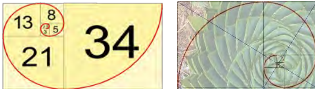
Figure 1.2. The Golden section, the numerical ratio of the Fibonacci sequence found in the proportional golden ratio of spiral aloe.

This natural sequence order follows the Fibonacci proportional golden ratio; in which each number in the sequence is the sum of the two preceding ones, the next number would be '1' repeating the first, because there is nothing yet to add on to the first, and the third number is the sum of first and second numbers, resulted in '2', subsequently, adding the two numbers before, the sequence become 1, 1, 2, 3, 5, 8, 13, 21, 34, 55...etc. This sequence of numeric pattern is found relevant and supportive to spiral construction in plants, as Balmond (2007) has stated: