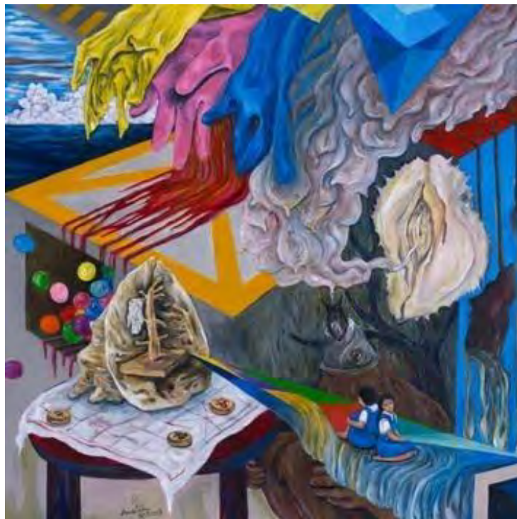
Figure 1.9.3. Anna Chin Chui Han, ‘The Growth Within’, 2013. Artist Collection

In this painting, I used organic shapes to represent feminism, and applied the similarities and differences among shapes and forms to symbolically describe women’s natural characteristic and mothers’ fighting spirit and strength, against all odds with sacrificial and unconditional love. The liquid-like form symbolises the vulnerability and flexibility in toleration, while the geometrical and hard-edged shapes symbolise the opposite and intolerable. As a whole, it interprets the meaning of tolerating to the spirit of compromising and finding balance between order and chaos.