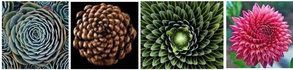
Figure 1.4. An example of Fractal patterned plants and florals.

Many plants and flowers (Figure 1.1.4) have a Fractal or Fibonacci number of petals which are natural growing patterns that rotate and move away from itself; the end becomes the beginning of something new, which may extend to become bigger or contract to become smaller. These petals significantly grow in radial, intersecting or cross section patterns with repetitive gradual scaling and moving outwards into the negative space, demonstrating double set of spirals in two different directions (Ferment's spiral) on its rhythmic construction, hence, enhancing the visual effects of illusory depth and spiral movements.