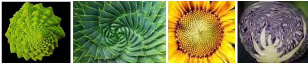
Figure 1.1. Examples of the Phyllotaxi plants with pattern of Fibonacci spirals and cross section. Images taken from https://clevelanddesign.com/insights/the-nature-of-design-the-fibonacci-sequence-and-the-golden-ratio/ . Retrieved on 7 February 2020.

Growing plants live in a cyclic motion; regularity is the motional form of pattern, difference and chaos immersed when each repetitive unit breaks out and possesses a slight variation between individuals among all similarities. A plant formation in nature may overall appear the same and repetitive to us; however, the chaos and changes that occur in each individual repetition is the beauty generated and integrated within the nature of regularity and repetition.